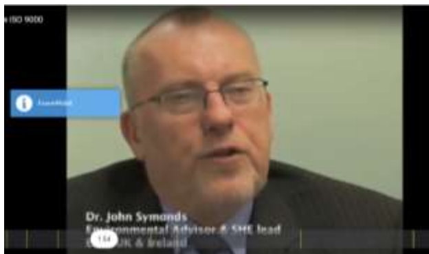
Fig. 3. Interactive video screenshot

Interactive videos are another way to engage students in active interaction with information (Fig. 3). With their help, the teacher can create interactive video tutorials by attaching polls, tests, open questions, links to other resources to them, as well as designing scenarios and learning paths. The main advantages of using interactive videos instead of the usual educational video materials include parallel monitoring of learning content development and overcoming students' passivity. The ways of using interactive video resources are diverse: video instructions, quests, developing skills for solving problems, creating role-playing games, etc. [12].