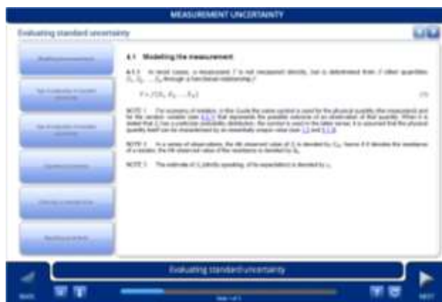
Fig. 4. CourseLab simulator for studying uncertainty of measurements

Better opportunities for developing professional skills are provided by tools for creating electronic training materials. The most famous of them are Articulate Storyline, iSpring Suite, CourseLab, Adobe Captivate. All of them allow you to implement the learning path, include video, audio, graphics, tests, interactive simulators, interactivity of various types with automatic sending of results to the e-learning system. Fig. 4 presents an example of such a simulator for measurement uncertainty.