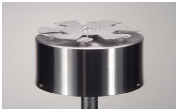
Fig. 2. EFM-100C Electric Field Mill Boltek (USA)

Known sensor EFM-100 Atmospheric Electric Field Monitor produced by BOLTEK CORPORATION. Sensors (Fig 2) of this type have a fast rotating plate (rotational frequency reaches thousands of rotations per minute), which requires a large electric power supply, and creates significant problems in maintenance.