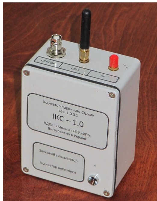
Fig. 3. The electronic devise of the field strength meter (X-1)

The authors consider it advisable to unite the TWS system with the one of the new LLS systems [6-8]. This will significantly increase the reliability of alarm.