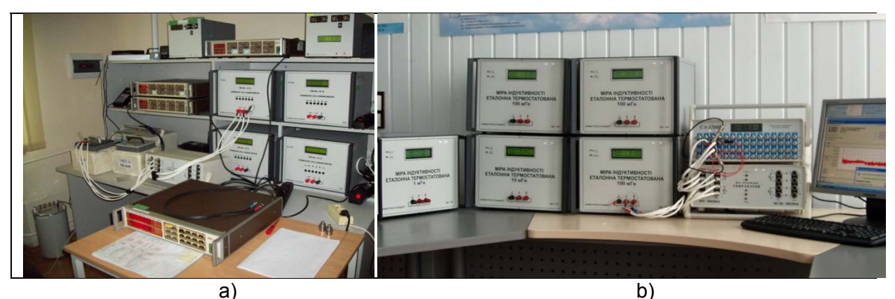
Figure 3 Complex equipment: a) GUM (Poland), b) DETU 08-09-09 (Ukraine)