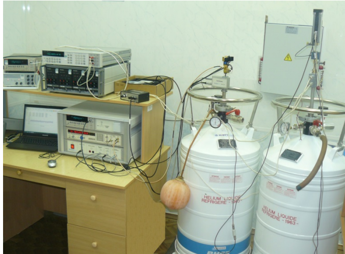
Fig.1 Photo the Josephson voltage standards during comparison.